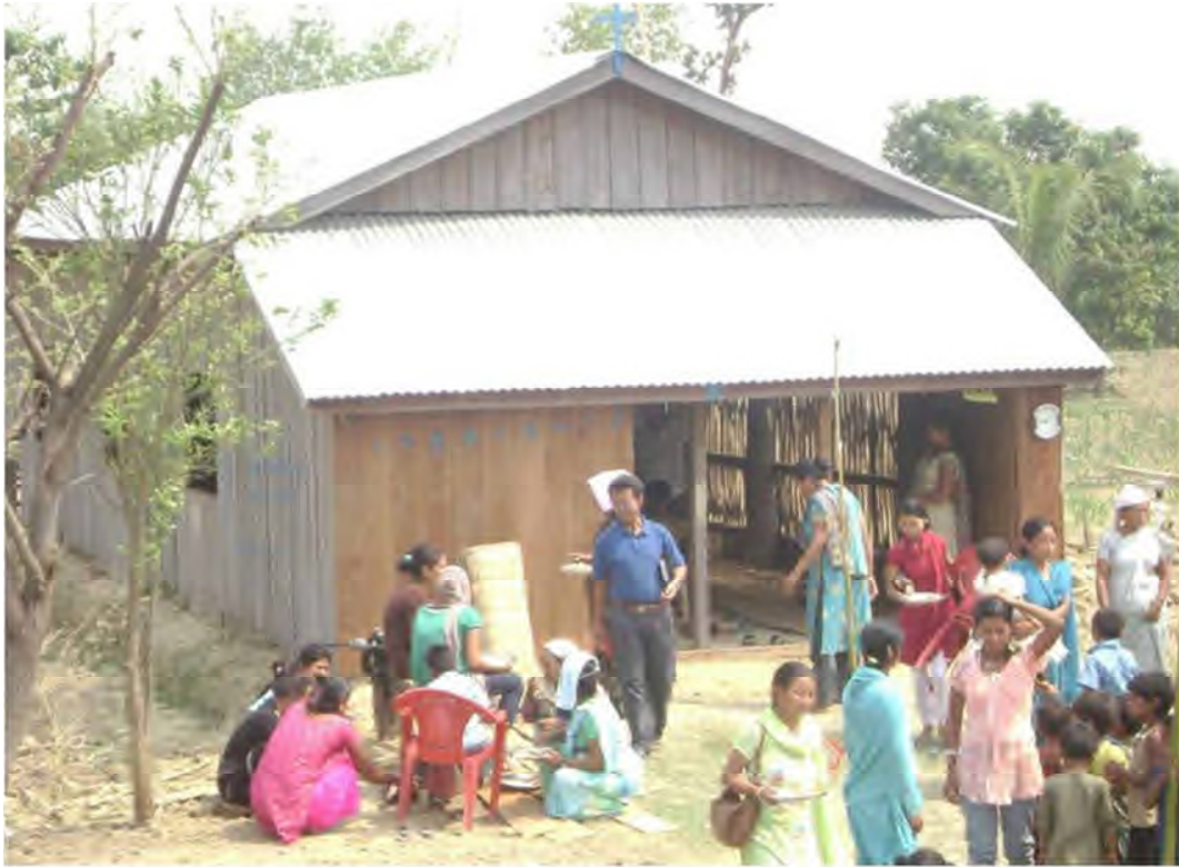
Nepali believers walked for 12 hours to visit this village where they planted a new E.C. Church.