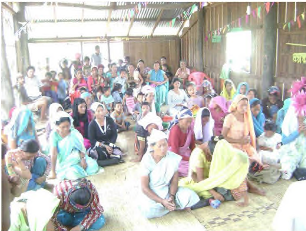
Nepali believers worship in Jiudo E.C. Church.