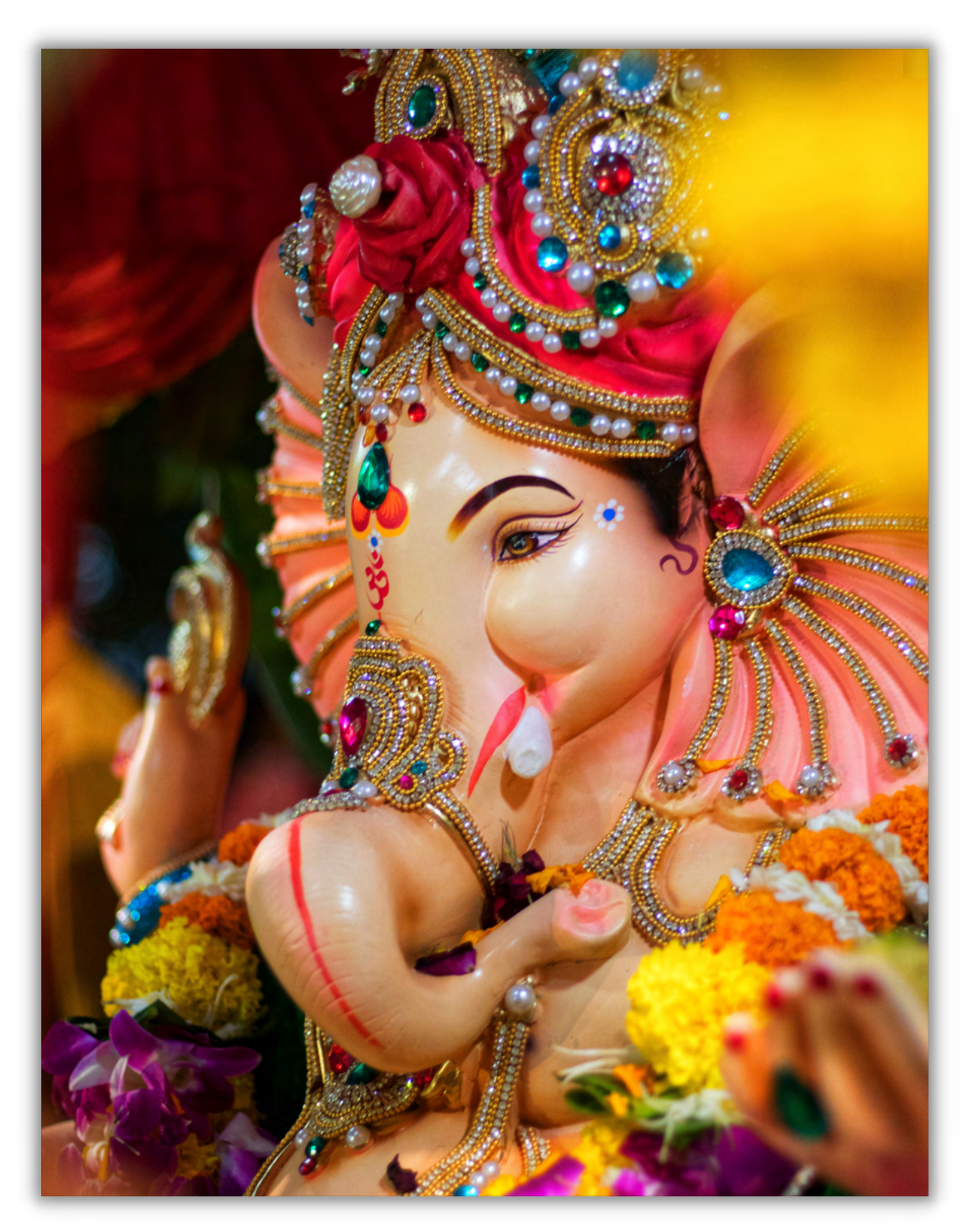
The Hindu god - Ganesh